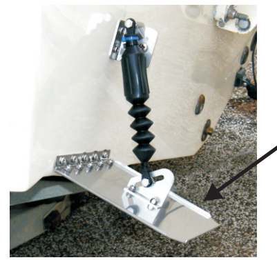
SMART TABS plates in the RUNNING POSITION

Follow the instructions on Page 6 of the installation manual and substitute the PR500 Bracket for the standard Transom